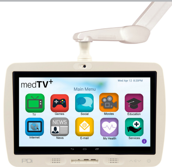
med TAB 19